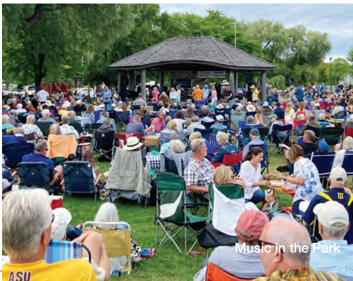
Music in the Park