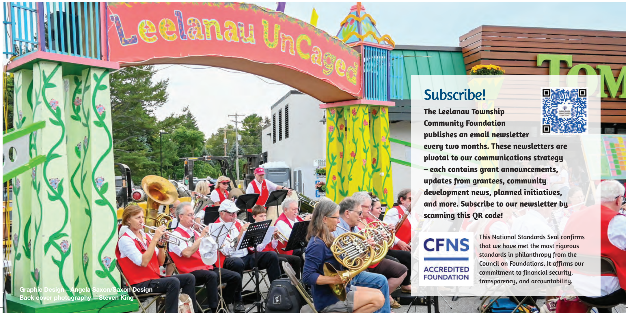
Graphic Design — Angela Saxon/Saxon Design

PO Box 818 Northport, MI 49670 231 386 9000 LeelanauFoundation.org