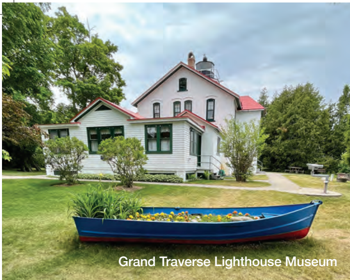
Grand Traverse Lighthouse Museum